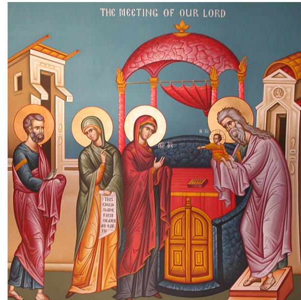
Meeting of our Lord

Last Sunday's Attendance: 94 Adults 31 Children