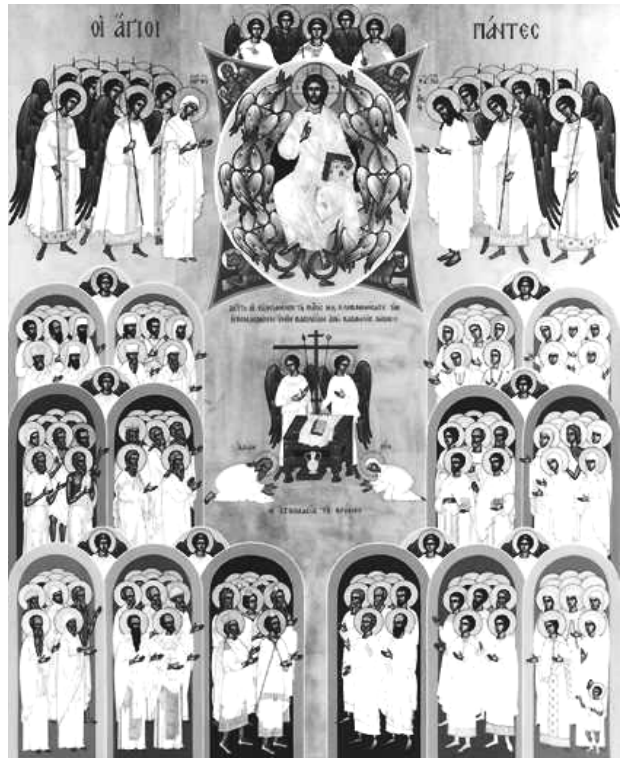
Sunday of All Saints