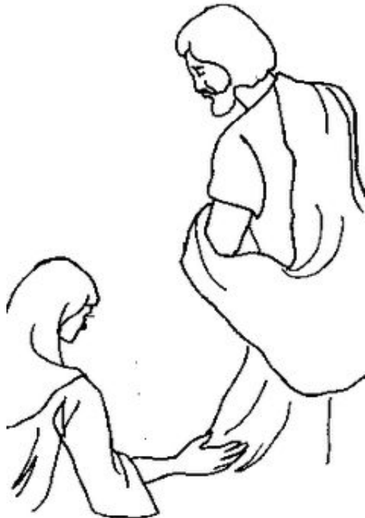
The Humble Touch of Faith

E-mail info@stjohnofdamascus.org with your request.