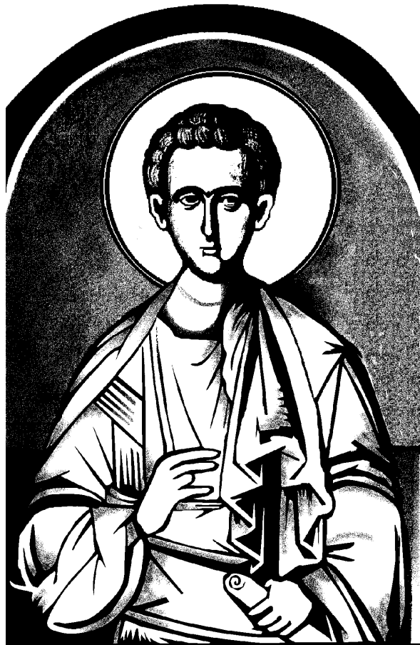
Holy Apostle Philip

E-mail info@stjohnofdamascus.org with your request.