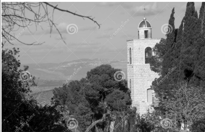
Photos of Mount Tabor from a distance and the Orthodox Monastery of St Elias on Mount Tabor