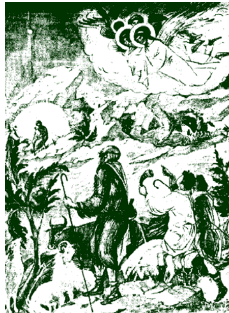
Angels announce Christ's birth to the shepherds

Brethren, but when the fullness of the time came, God sent forth his Son, born of a woman, born under the law, 5 so that he might redeem those who were under the law and so that we might receive adoption as children. 6 And because you are children, God has sent forth the Spirit of his Son into your hearts, crying, "Abba, Father!" 7 Now you are no longer slaves, but children; and if [you are] children, then [you are] heirs of God through Christ.