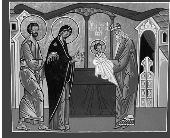
Icon of St. Basil the Great and the Circumcision of our Lord & Savior Jesus Christ