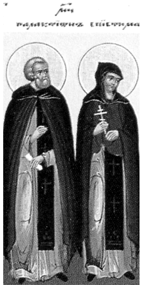
Ss Galacteon & Epistemis

Include Something in the Bulletin or Be Included in our Weekly E-mails E-mail info@stjohnofdamascus.org