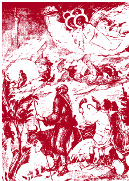
Angels announce Christ's birth to the shepherds

Brethren, but when the fullness of the time came, God sent forth his Son, born of a woman, born under the law, 5 so that he might redeem those who were under the law and so that we might receive adoption as children. 6 And because you are children, God has sent forth the Spirit of his Son into your hearts, crying, "Abba, Father!" 7 Now you are no longer slaves, but children; and if [you are] children, then [you are] heirs of God through Christ.