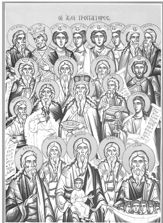
The Holy Forefathers of Christ

E-mail info@stjohnofdamascus.org with your request.