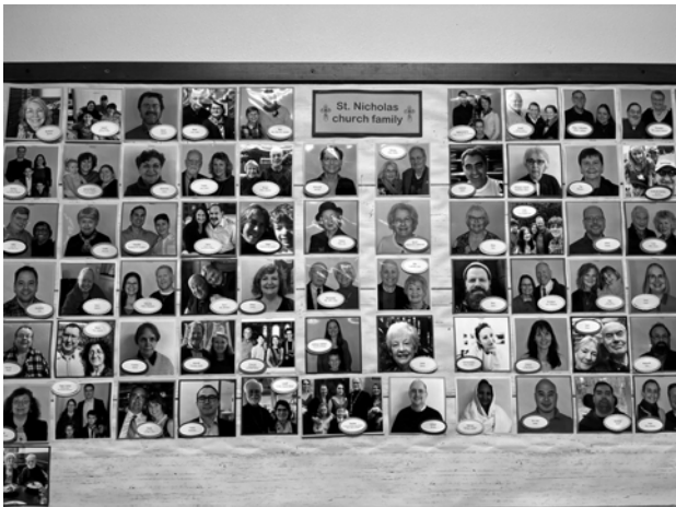
The above picture of a photo directory is taken from St Nicholas Orthodox in Portland, OR. A number of parishes in our Diocese as well as around the country are doing similar things to address the quick growth in their communities.